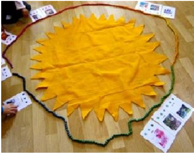
Children playing spontaneously with the Sun Game

primitive species'. She argued that the democratic and peaceful organisation of a society depends upon the independence of the individuals that make it up. For Montessori, social interaction is something that enhances the value of individuality, and this in turn promotes the individual person (Montessori, 1949, p56).