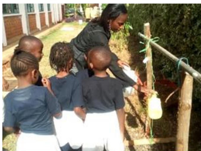
A 'tippy-tap' at Mount Kenya Academy

To take a concrete example of the model in action we may draw from a project that we developed as a collaboration between OMEP preschools in the UK and Kenya. The project was launched on United Nations World Water Day (March 22nd 2016) and it showed how children could learn through self-directed and exploratory free-flow play, and how teacher directed focused learning activities could be used to 'seed' this free play, and support progression in each child's learning and development. In Kenya and in the UK the children were shown how to make 'tippy taps' from recycled materials. The tippy taps varied in shape size but they all provided the same affordances in terms of providing an inexpensive and