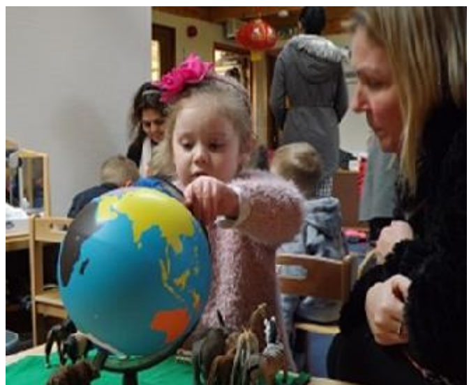
The continental origins of animal species

Montessori also rejected the idea that life could be understood simply in terms of adaptation and a struggle for survival against an often hostile environment ( op cit , p94-5). She argued that such a view ignored the complex nature of ecological interdependence and the ways in which the survival of every species is ultimately dependent upon the survival of others. She aligned herself with biologists