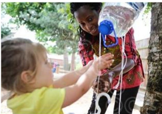
A 'tippy-tap' at Townsend Montessori UK

efficient means of providing and conserving water for hygiene purposes wherever it was needed. The use of the tippy tap schema was then encouraged in the children's free flow play in the settings, and at home. In the process all of the children learnt about the experience of living in each country, about the importance and global scarcity of clean water, about the importance of hand washing, and perhaps most significantly, they learnt about how they could be part of a solution to this practical problem of conservation.